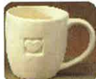
24oz. Heart Mug $22