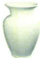
Vase, 6" tall $24