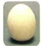
Easter Egg $16