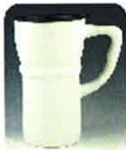
Travel Mug $24