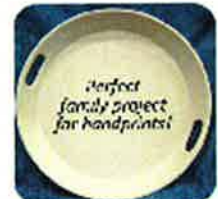
14" Round Serving Tray $43