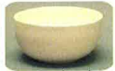
Cereal Bowl $20