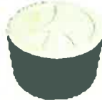
Peace Sign Box $22