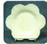
6 3/4" Flower Plate $16