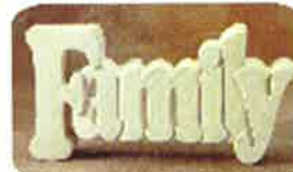
10 1/2" x 5 1/2" Family Plaque $27