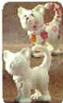
Cat or Puppy Figurine $20 (each)